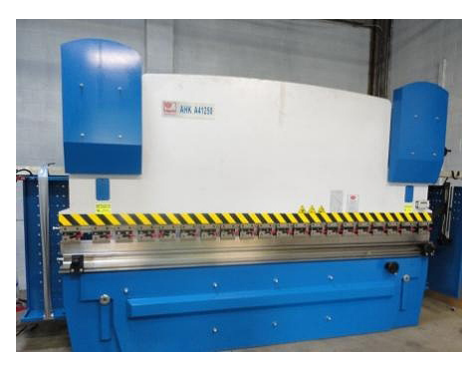
[Our new KNUTH 14' Press Brake 1]

BUT-----What is "brake metal"? Basically, the answer is simple: brake metal is the end-product of sheet metal being cut, then run through and "formed" by a machine called a brake or press brake and thereafter finished/assembled to spec. As this resultant product is most often used to add an esthetic (or architecturally "beautiful") look to buildings, both on the exterior and in their interior spaces, it is often called " ARCHITECTURAL BRAKE METAL" .