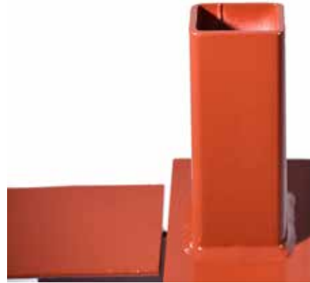
▲ AESS 3: HSS weld seam oriented for reduced visibility.

B. Place weld tabs for temporary bracing and safety cabling at points concealed from view in the completed structure or where approved by the Architect during the pre-installation meeting. Methods of removing temporary erection devices and finishing the AESS members shall be approved by the Architect prior to erection.