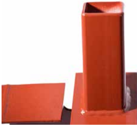
▲ AESS 2: HSS weld seam orientation not defined.