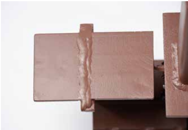
▲ SSS: Weld backing bar in place and non-uniform welds.