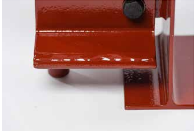
▲ AESS 1: Continuous weld appearance.