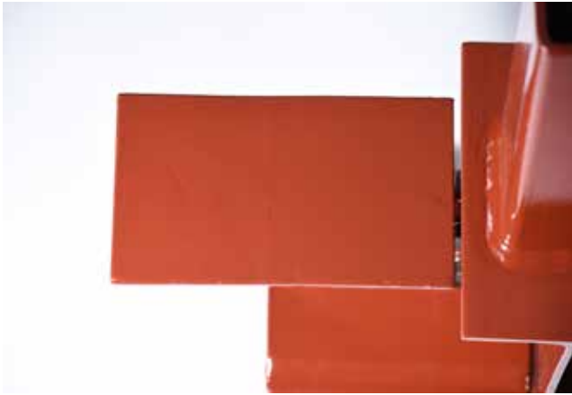
▲ AESS 3: Joint gap tolerances minimized, butt and plug welds ground smooth and filled.