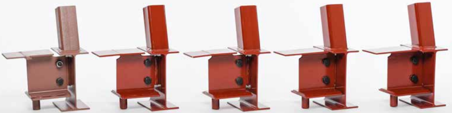
▲ From left to right: Standard structural steel (SSS), AESS 1, AESS 2, AESS 3 and AESS 4.