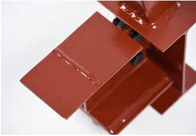
▲ AESS 2: Standard joint gap tolerances.