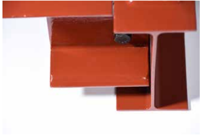
▲ AESS 4: In addition to a contoured and blended appearance, weld transitions also are contoured and blended.

M. Continuous Weld Appearance: Where continuous welding is noted on the drawings, provide welds of a uniform size and profile