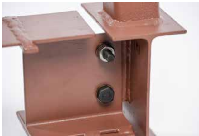
▲ SSS: Bolt head orientation not defined.