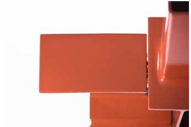
▲ AESS 4: Surfaces filed and sanded.