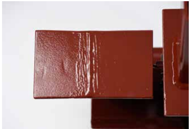
▲ AESS 1: Welds uniform and smooth and backing bars removed.