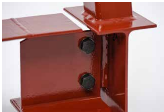
▲ AESS 1: Bolt head orientation defined, backing bar removed.