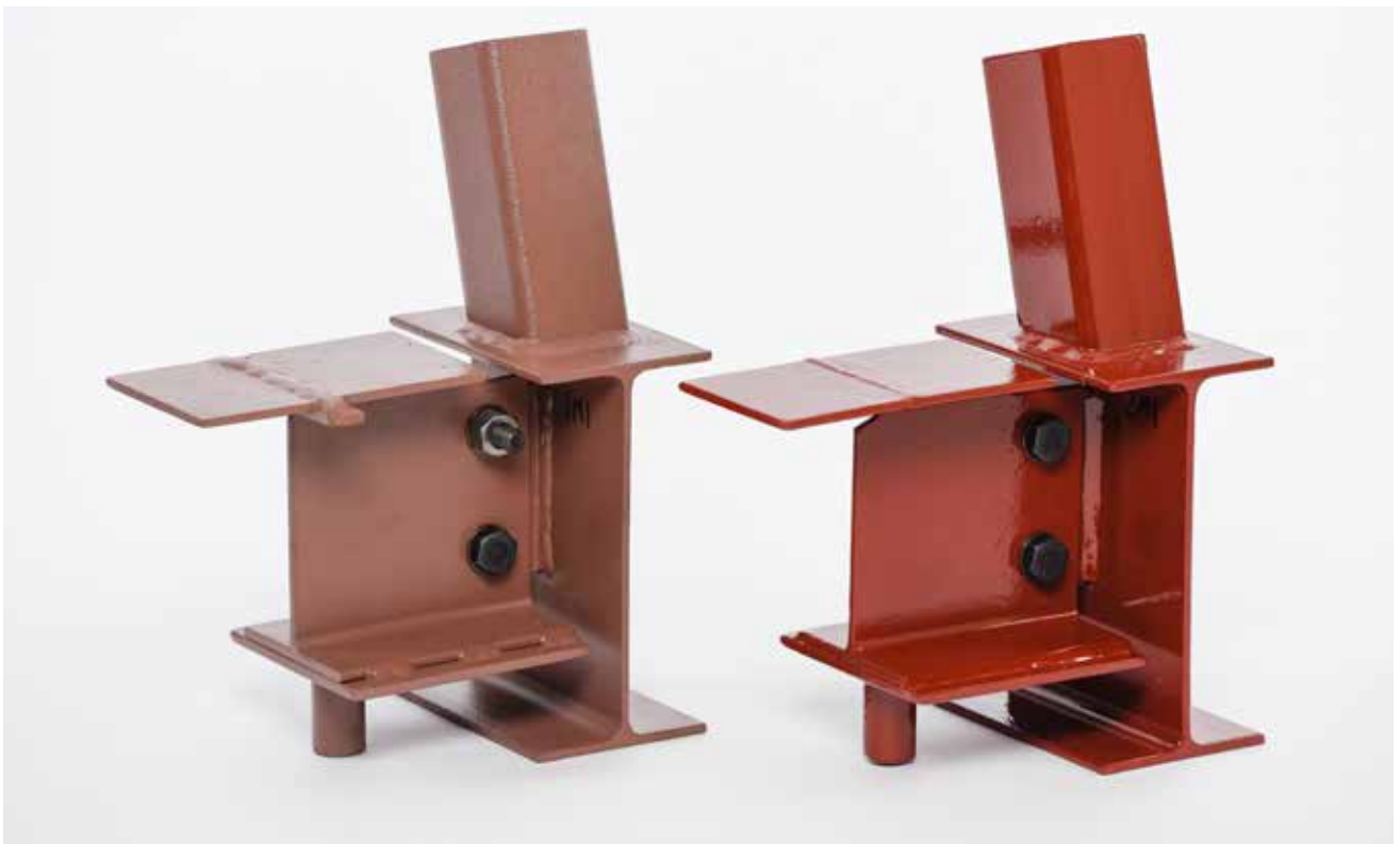
▲ Left: Standard structural steel (SSPC-SP2). Right: AESS 1 (SSPC-SP6).

Note that both the sample specification below and the cost matrix that follows (page 52) were produced by the Structural Engineers Association of Colorado and Rocky Mountain Steel Construction Association Steel Liaison Committee. They are not products of AISC.