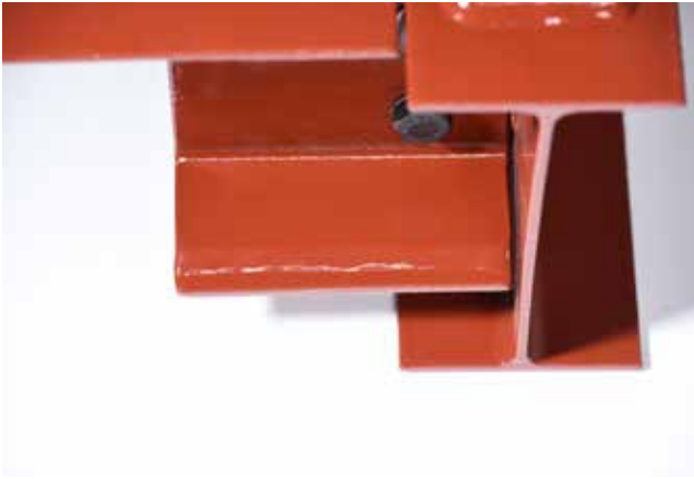
▲ AESS 3: A contoured weld.