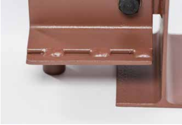
▲ SSS: Intermittent/stitch weld between bottom flange and cover plate.